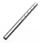
Adapter Kit 1 for Filling Shoe 50